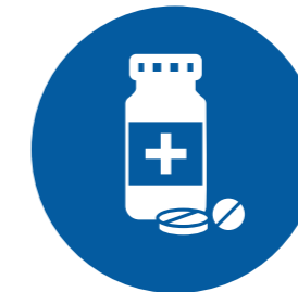
COLD CHAIN & PHARMACEUTICAL LOGISTICS