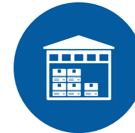
WAREHOUSE & CONTRACT LOGISTICS